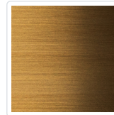
Vintage Brass (VB)

* For custom options, contact customer service.